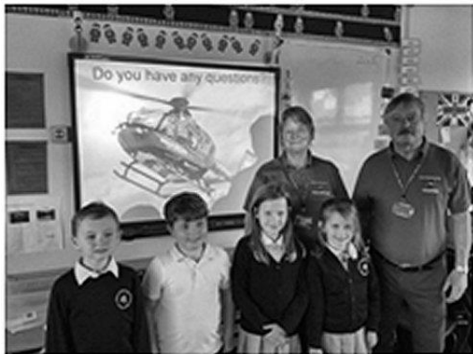
Members of the Air Ambulance Volunteers with some of the children

During the last week in April, members of the Air Ambulance Volunteers visited the school to talk about the benefits of having the Air Ambulance in this area. This proved to be a fertile ground for questions. The children were most interested in their activities.