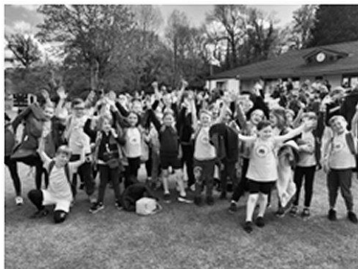
Cherry B celebrate at Sandford

In the meantime, it has been Class 2's time at Forest School. I quote : 'They lit fires, made delicious nettle and cheese bread and even had time to create some natural art work'. It sounds as if they had a very enjoyable time of it!