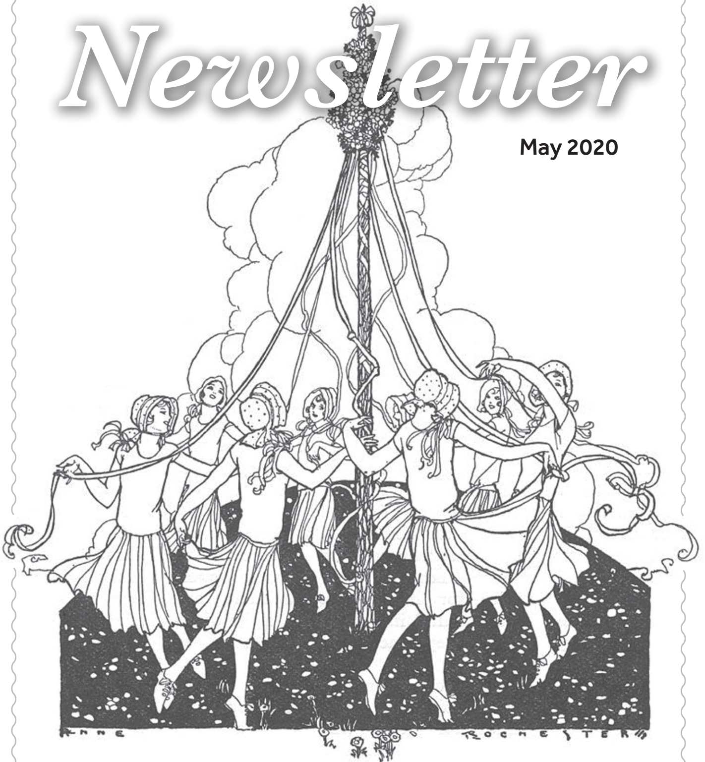
Morris Dancing round the Maypole.