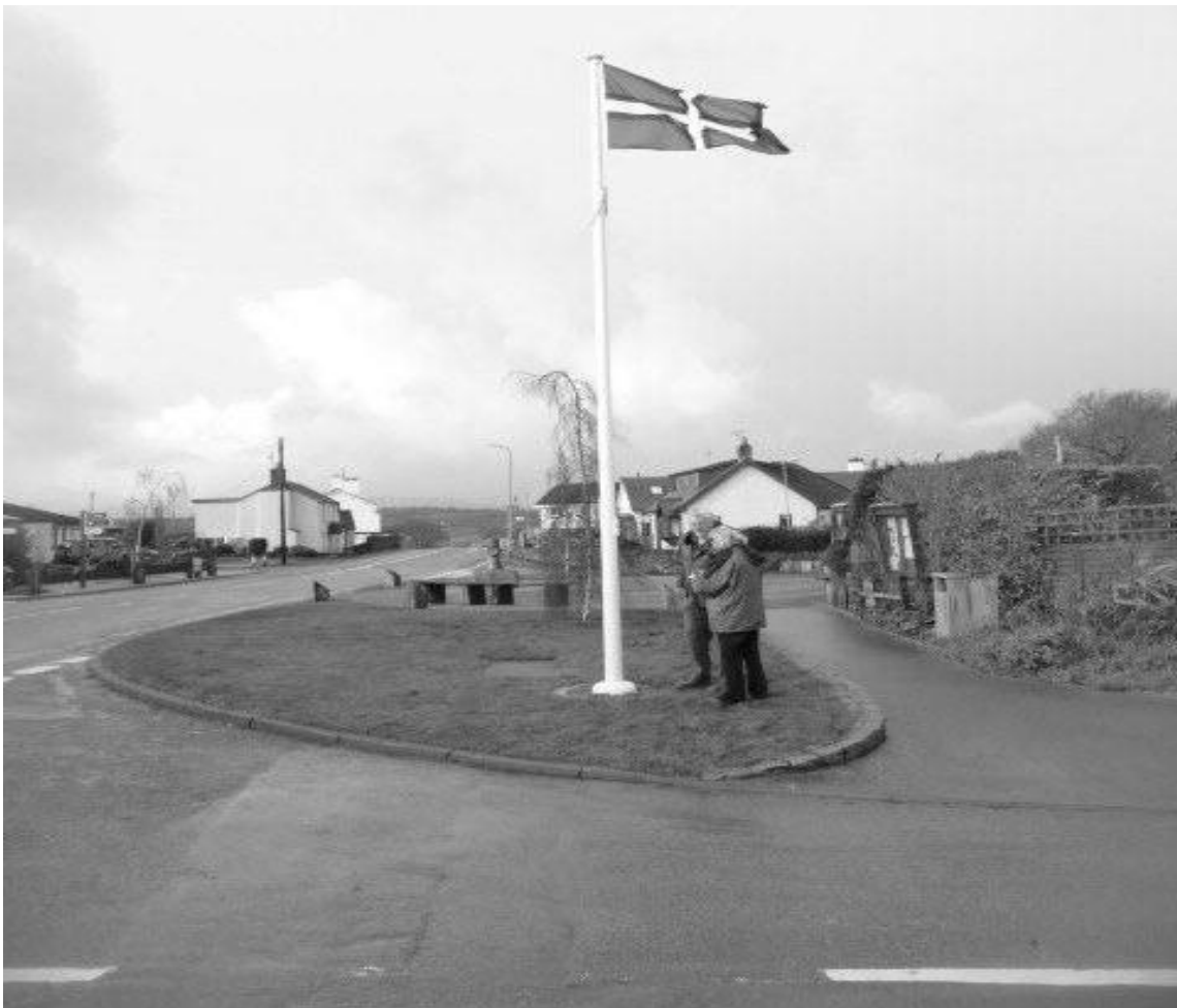
The new flagpole with the Devon flag having its first airing!