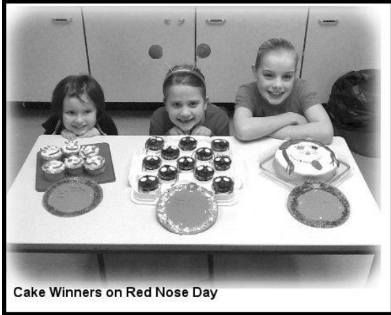
Cake Winners on Red Nose Day

Since I last wrote, there seem to have been a few more events organised than appeared on the calendar and I've got a few photographs which I hope will successfully weather the actions of the printer. The big action day was Red Nose Day. On the left, are the winners of the cake baking competition on that day. The children were encouraged to help their parents bake a Silly Face cake and bring it into school. If you have difficulty making out the subjects, there are two sets of cup cakes and one large cake. Well done the winners. By the looks of the cakes you deserve to win.