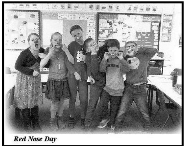
Red Nose Day

good indication of the red noses and silly faces conjured up by the children. I don't yet know how much the school raised for Comic Relief but, judging by the effort put in, it ought to be quite a tidy sum. Well done to all concerned.