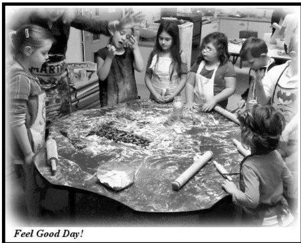
Feel Good Day!